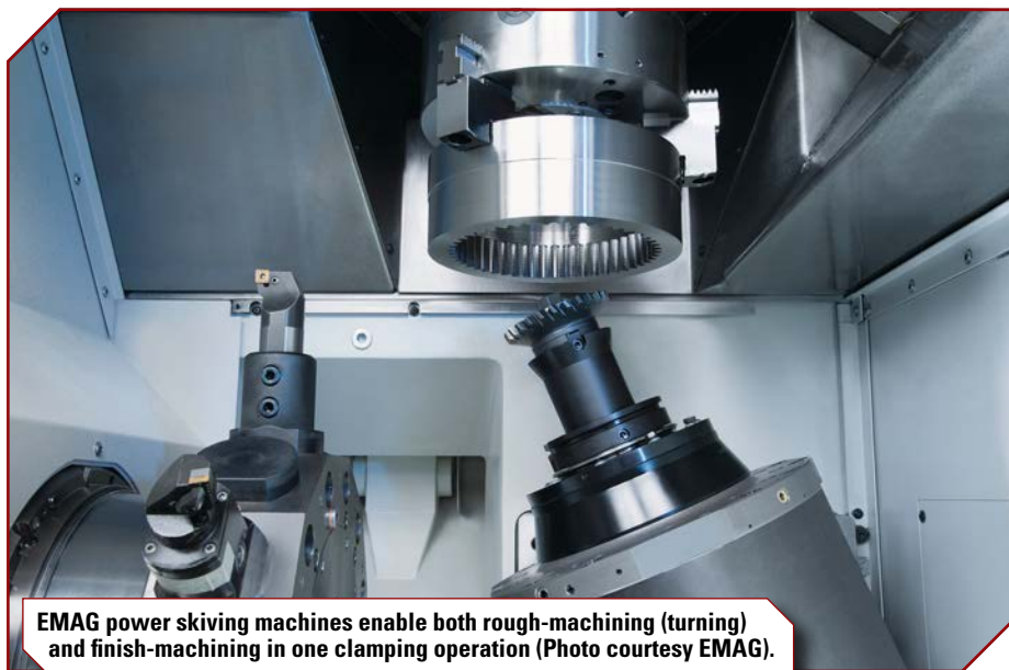
EMAG power skiving machines enable both rough-machining (turning) and finish-machining in one clamping operation.

Related to “workpieces with constraining contours,” take for example an input or output shaft. For shaping a spur gear or a spline, the shaping head being in the same plane with the tailstock has a high risk of collision, if the cutter diameter is not large enough. Power skiving, due to the cross axis angle, can be less critical as you are moving the power skiving