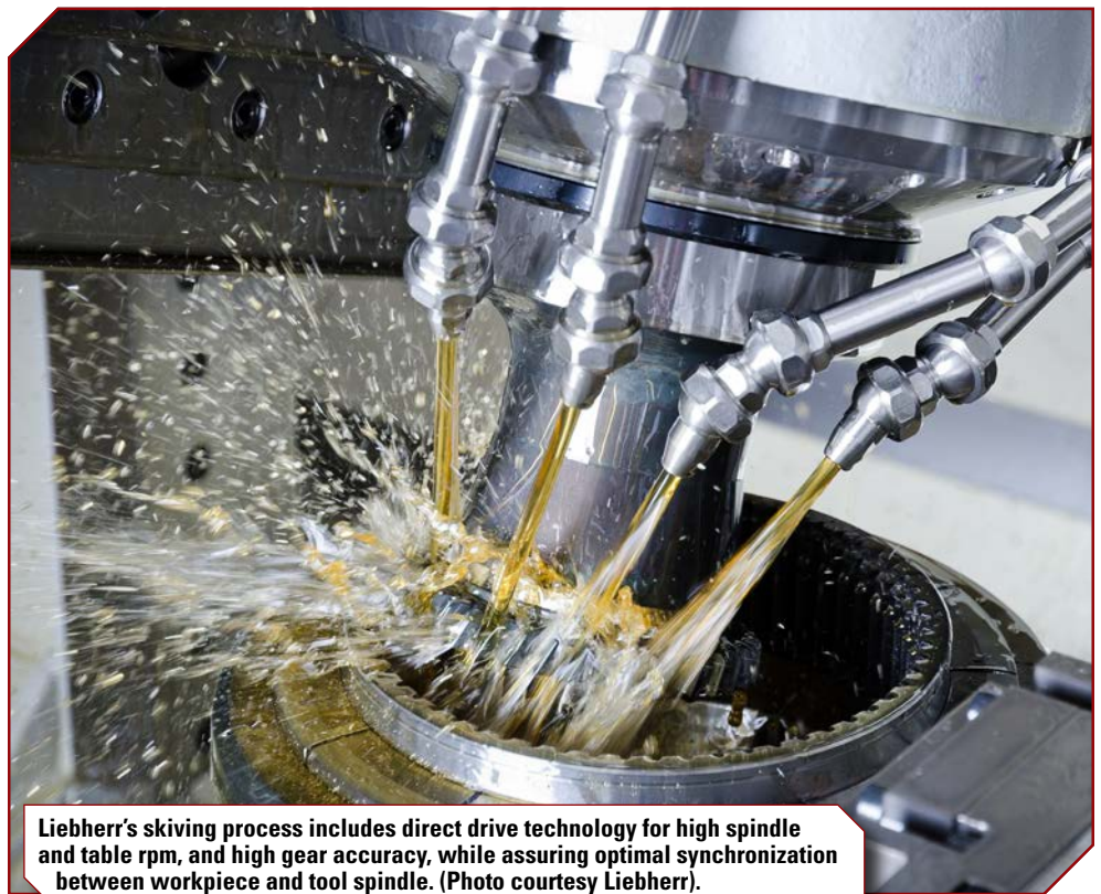
Liebherr's skiving process includes direct drive technology for high spindle and table rpm, and high gear accuracy, while assuring optimal synchronization between workpiece and tool spindle.

BYLUND. As with all manufacturing technology requirements on workpieces change. Power skiving does not work if there are shoulders close to the gears or splines, or when the teeth are very deep into the part. “Parts