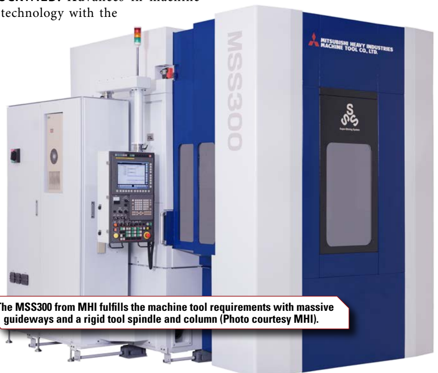
The MSS300 from MHI fulfills the machine tool requirements with massive guideways and a rigid tool spindle and column (Photo courtesy MHI).

In addition, the flexibility of the machine is very important. Features like stock dividing, automatic tool changer, automatic loading/unloading and integrated deburring are enhancing the process. With the same power skiving system we have the possibility to cut gears in a soft and hard condition. In many cases we are eliminating an additional manufacturing step by integrating the deburring capability into the power skiving tool for internal gears or adding a rotary chamfering unit for shafts on our horizontal machine.