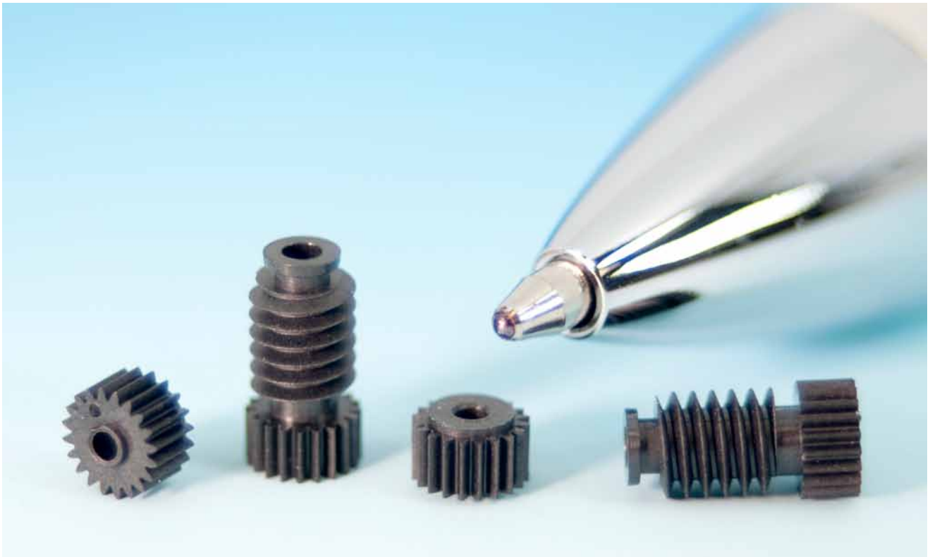
Kleiss provides molded plastic gears for a variety of applications.

Winzeler Gear 7355 West Wilson Ave. Harwood Heights, IL 60706 Phone: (708) 867-7971 www.winzelergear.com