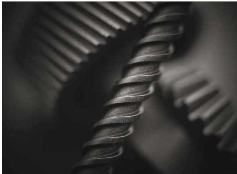
Winzeler Gear has reaped the benefits of plastic gearing from a weight, friction reduction and sound quality perspective (courtesy of Erich Schrempf, Schrempf Studios).

days,” Kleiss says. “Metal is sometimes considered as a possible alternative manufacturing method, but only if every possible solution in plastic has been rejected. We promote performance as the key goal. Performance is cost-effective. Cost-effective means dollars saved and a