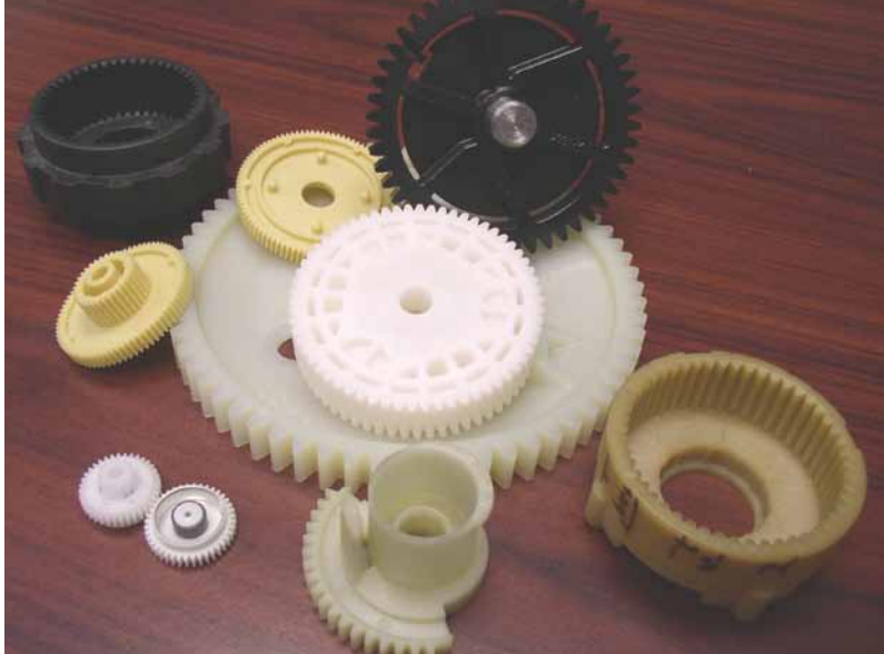
Making millions of copies of a plastic gear from a mold is a cost-effective way to produce high volume.

In the end, both methods have advantages and disadvantages