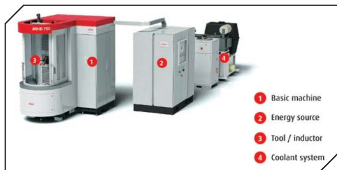
Figure 1 Manually loaded, semi-automatic or production line-integrated – the modular design of the MIND-system suits every production environment.

Where quality matters. Eldec experts are very well aware of the fact that the interaction between key components such as inductors, generators and coolant systems, and a multitude of other components including indexing tables, spindle drive and control systems, is of utmost importance. Over the last three decades German-based Eldec has further developed their hardening technology, and in February of 2013 the company became a part of the EMAG Group. Precision and the integrity of the production process are important