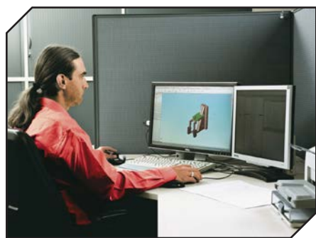
Figure 3 The Eldec shape of the tool is designed with great precision using 3D CAD software by specialist in inductor design.

Benefitting from general trends. With these trends, Eldec is benefitting in the automotive and aviation industries. The geometries of many components are becoming more complex and, at the same time, pieces tend to get smaller. The hardening process must keep pace with this development and guarantee the