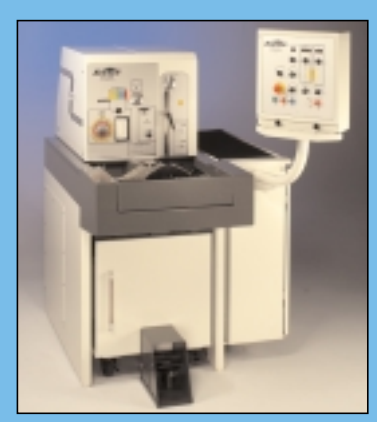
SUNNEN INTRODUCES ML-2000 HONING MACHINE

Phone: + (61) 3-9751 8267 Fax: + (61) 3-9761 6906 E-mail: janl@anca.com.au Internet: www.anca.com.au