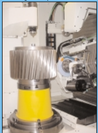
The NILES ZE800S.

Similarly, on-board dressing of grinding tools is a significant advantage. Instead of a separate device and more setups, dressing takes place on the machine. This helps save idle time and improves quality, Walsh says.