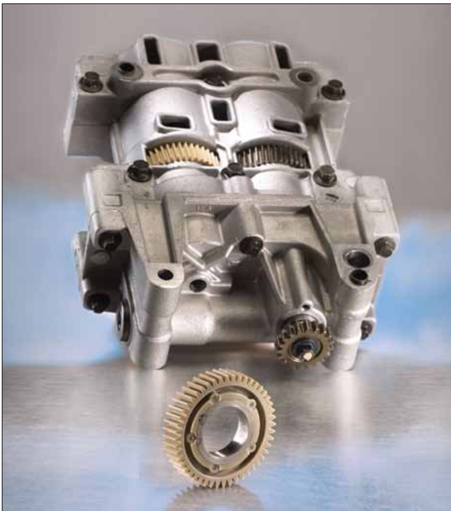
Metaldyne balance shaft modules, featuring PEEK polymer gears, demonstrate reductions in inertia, weight and power consumption (All photos courtesy of Victrex).

Frank Ferfecki, technical program leader at Victrex, explains some other benefits. “It has very good toughness and elongation properties. It can take the high contact stresses that can be seen in gear applications. Relative to polymers, it basically is at the top of the food chain. The other thing that is nice for gears about it is that relative to other polymers from a material performance standpoint, it doesn’t