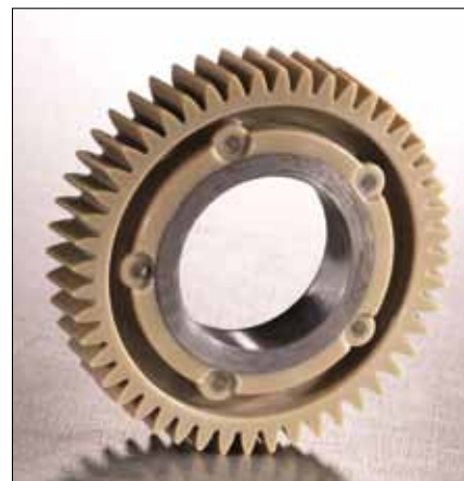
By switching from iron gears to PEEK, Metaldyne achieves roughly a 70 percent reduction in mass and almost 80 percent reduction in inertia in its balance shaft modules.

Victrex USA Inc. 300 Conshohocken State Road Suite 120 West Conshohocken, PA 19428 Phone: (800)-VICTREX Fax: (484) 342-6002 Americas@victrex.com www.victrex.com