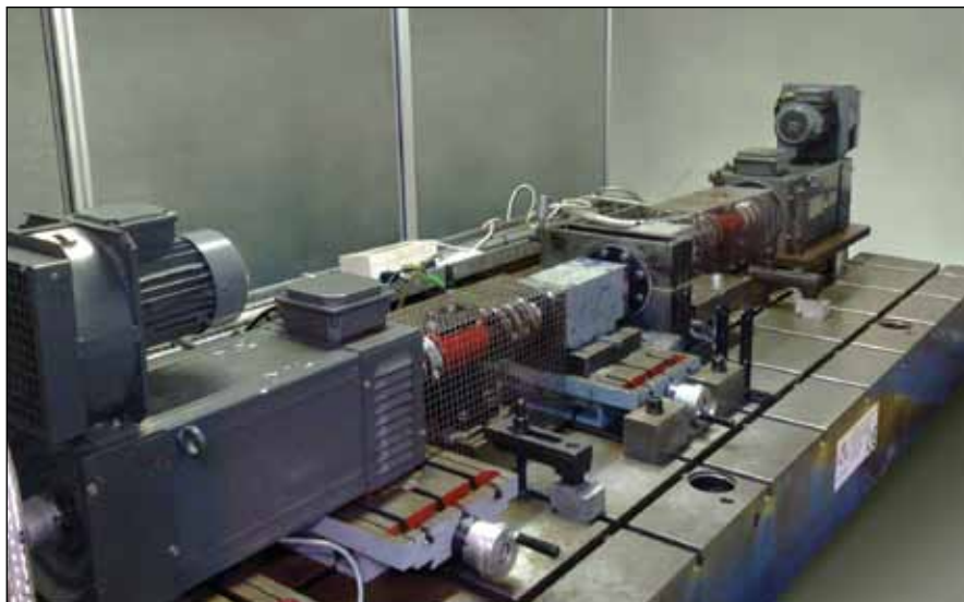
The Victrex applied technology center in the U.K. features a gear test rig invested in as part of a targeted effort to appeal to the gear market in various applications.

in the gear test rig in the U.K., but in our commitment to various customer programs. We're putting our money where our mouth is.