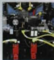
Precision Checking Heads