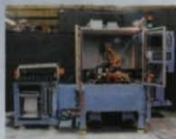
High Speed Automatic Functional Tester

Since 1936 ITW has provided the gear industry with gear inspection devices. Put your trust in the people who invented the process.