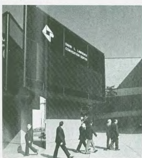
David Lawrence Convention Center

In conjunction with the show and also at the Lawrence Convention Center, is the AGMA Fall Technical Conference. The conference will be held Nov. 7-9 and will feature papers on a variety of gearing subjects including, worm gears, gear dynamics, vibration analysis, lubrication, and gear geometry.