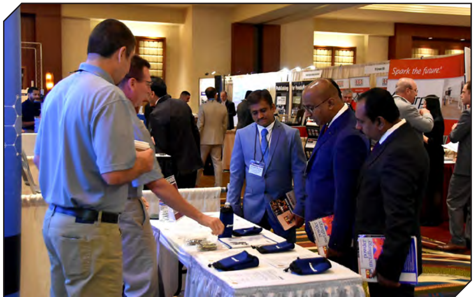
The PM industry hopes to return to its normal trade show schedule in 2021.

One family-owned company executive reports some customers have moved up ordering to build up inventories