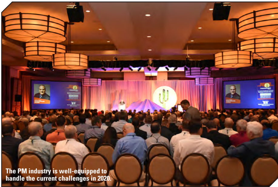
The PM industry is well-equipped to handle the current challenges in 2020.

for the future. As a result, he sees June orders rebounding somewhat. He is also making lemonade from the lemons he is dealing with by investigating process improvements, such as reducing scrap. In another facility, company engineers are devoting time to installing and qualifying new robots connected to compacting presses, furnaces, and machining