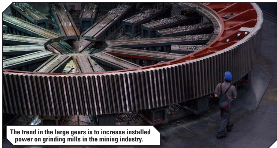
The trend in the large gears is to increase installed power on grinding mills in the mining industry.

measurement services for the replacement of older equipment for which the original design information may not be readily available. This type of work requires a different skill set than for installation supervision, and we are increasing our existing capabilities in this area.