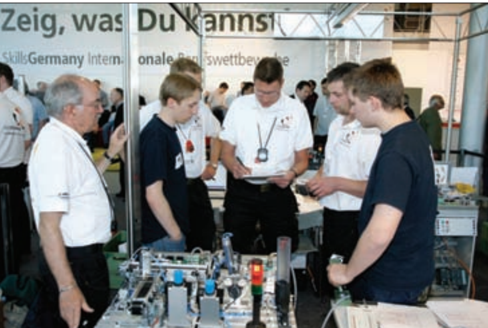
The “TechtoYou” program in 2007 featured a host of events for budding engineers.