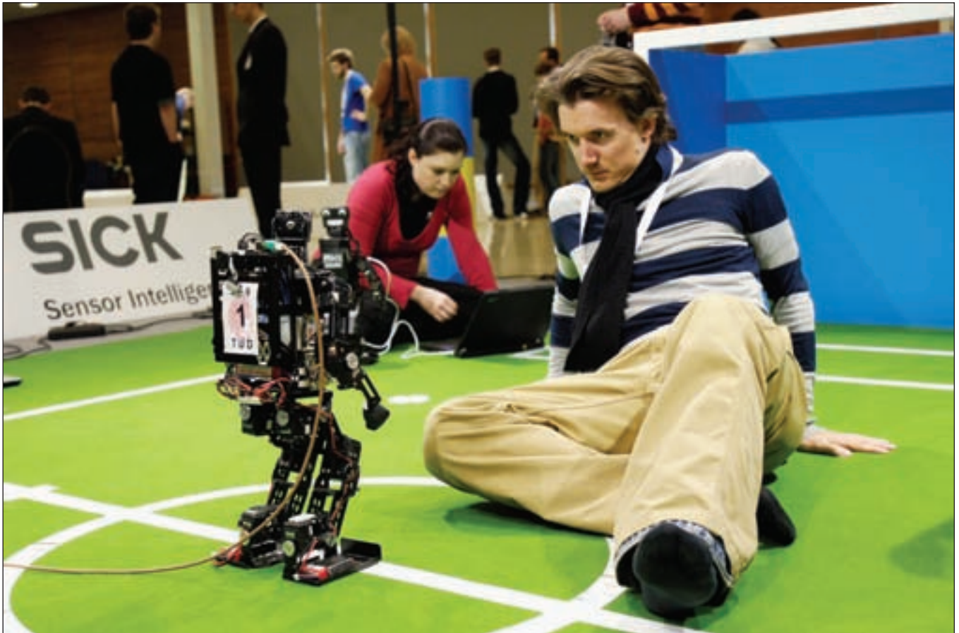
A participant in the RoboCup German Open 2007 preps for the competition.