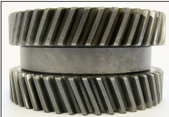
Figure 1 Double helical gear.

Double helical gears consist of a left hand and a right hand helical gear with opposite helix angles that are grouped together on one shaft. The two-toothed sides of double helical gears commonly have the same module (or diametral pitch) and the same helix angle, where the sign of the helix angle is opposite between the two sides (Fig. 1). The manufacturing problem of double helicals is the width of the space between the two-toothed section. This space has to provide sufficient over travel clearance for a hob cutter. If the groove is too small the two helicals can be manufactured separately and then assembled back-to-back on a shaft. If separate manufacturing is not an option, then a shaping process can be employed that will accommodate very small, over travel grooves between the toothed sections. Shaping is slow and the cutters used are non-standard tools that are expensive compared to standard hobs.