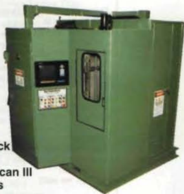
Scanpack with Magnescan III Controls