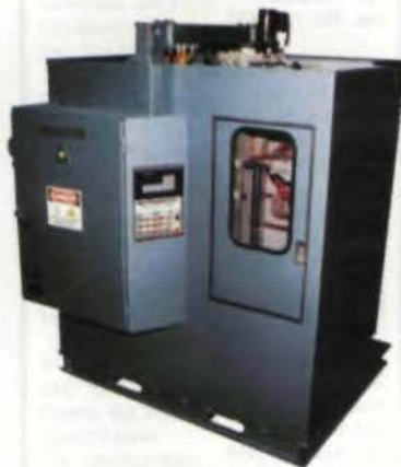
Scanpack with Magnescan II Controls