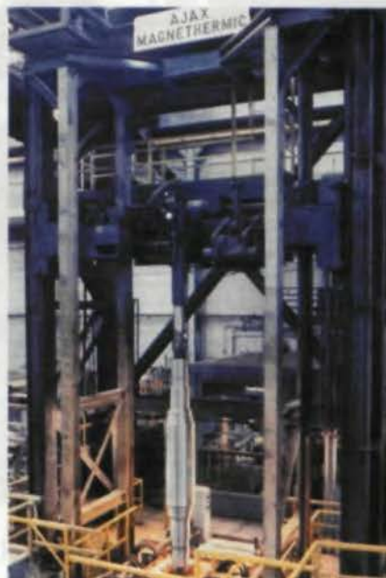
World's Largest for Mill Rolls