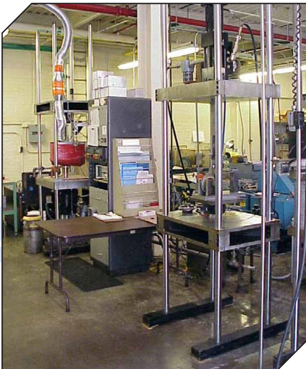
Single-tooth fixture equipment used for bending fatigue testing