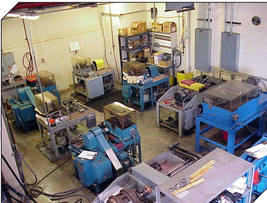
Some of the machinery used in GRI’s research and testing efforts.