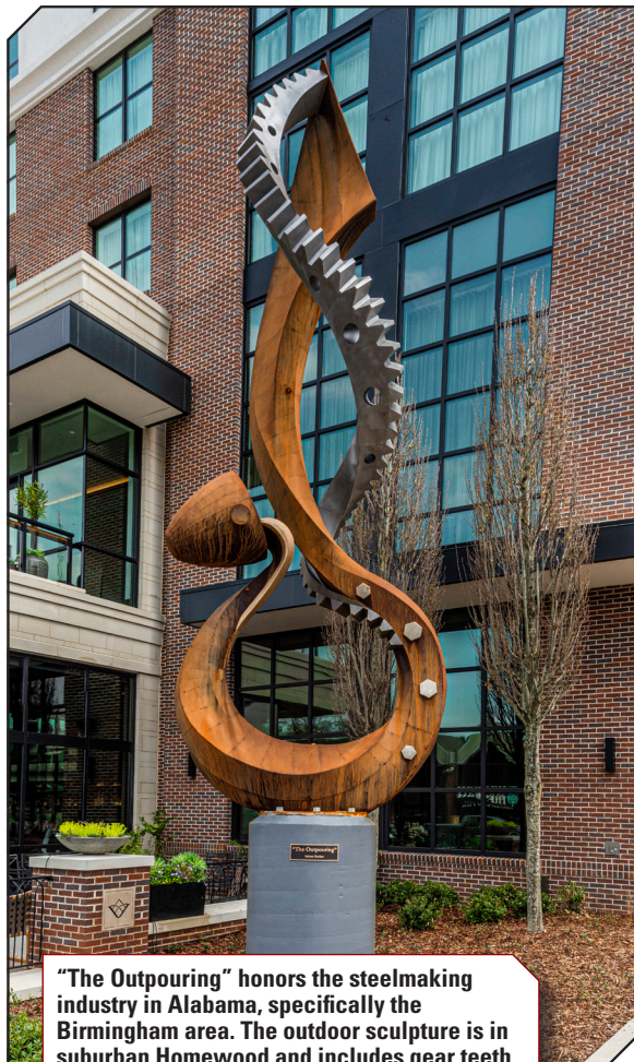
“The Outpouring” honors the steelmaking industry in Alabama, specifically the Birmingham area. The outdoor sculpture is in suburban Homewood and includes gear teeth that are meant to suggest precision machining.