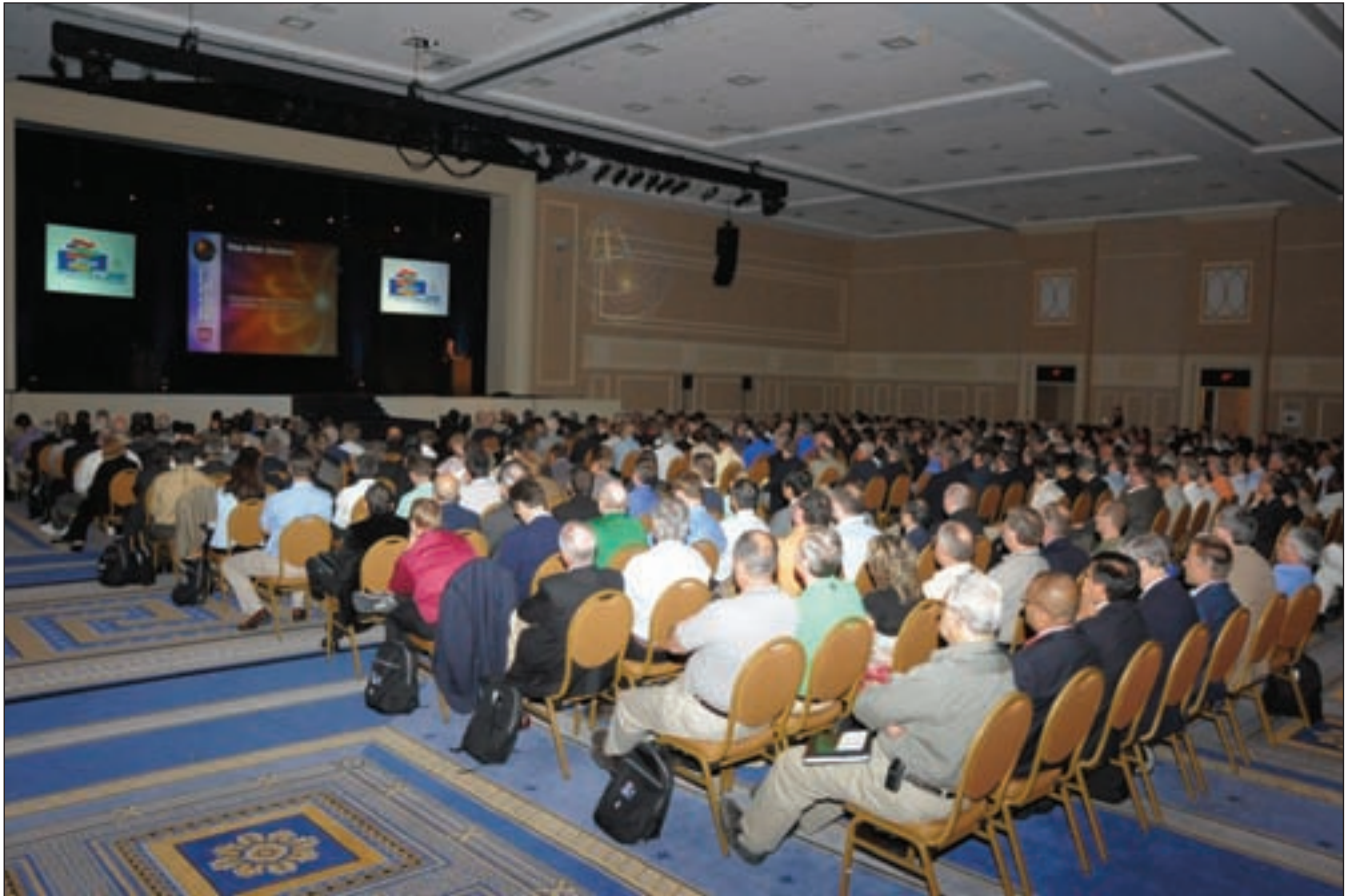
PowderMet2009 features a trade exhibition, 46 technical sessions, six special interest programs and a technical poster program.