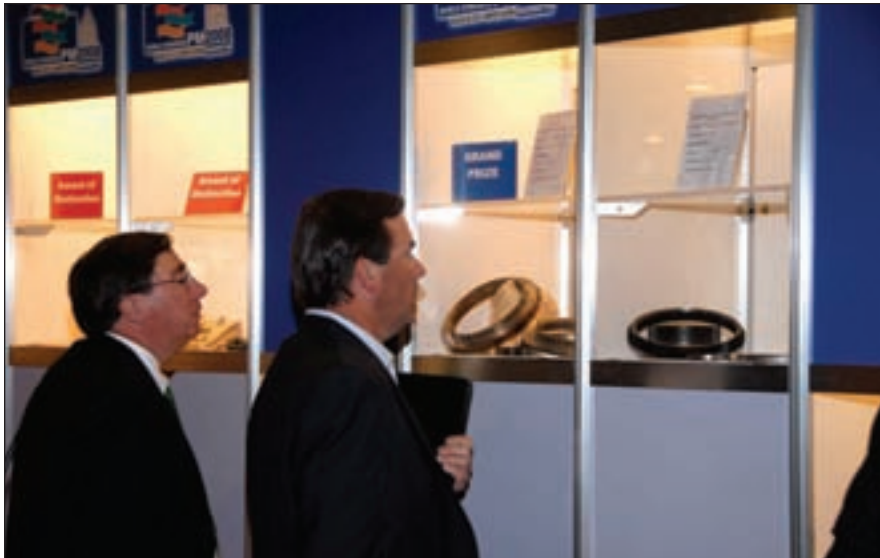
Attendees scope out some gears featured in the PM design excellence awards.