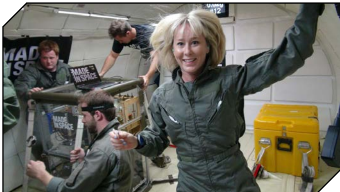
The Made in Space team conducts tests during a reduced gravity flight. Made in Space has over 400 parabolas of testing 3-D printing technologies in zero-gravity.