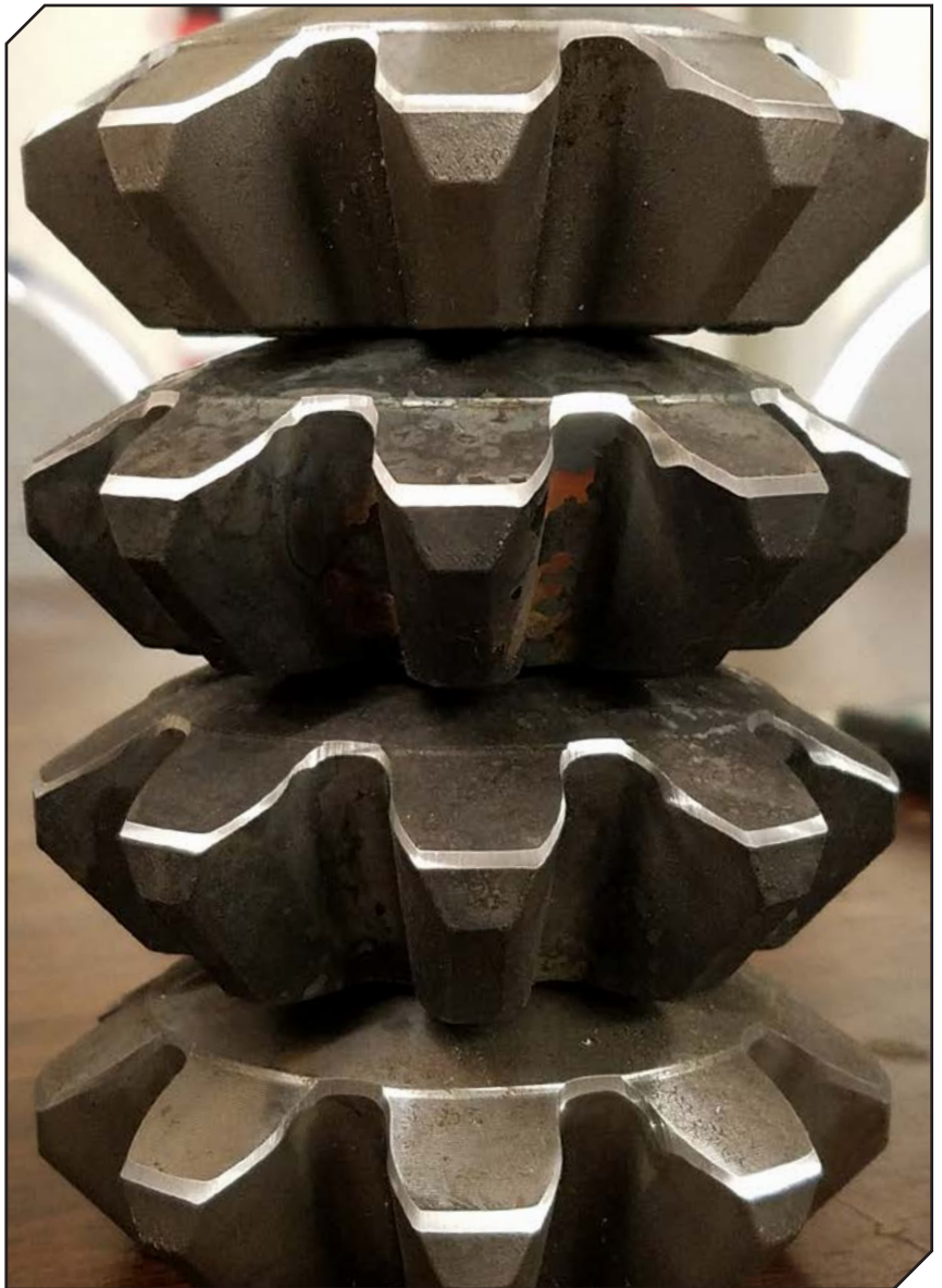
Figure 1 The four parts referenced in the article; No. 1, on bottom of stack, is the first soft part; No. 2, just above and on top of No. 1, is the first heat treated part after processing; No. 3 is next and on top of No. 2, and is the second heat treated part after processing; and No. 4 is the last soft part on top of No. 3, having been processed last. (Photo James Engineering).

We have yet to find a material that we cannot create a chamfer and/or edge finish on. As to whether we chamfer before or after heat-treating — that's a very different story.