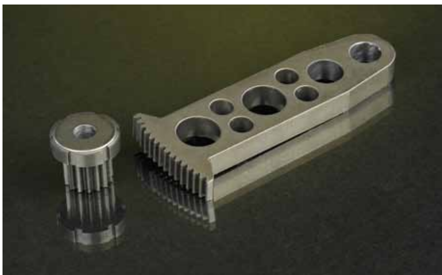
In the hardware/appliances category, this transfix gear and sector was given an Award of Distinction.

challenged and shaken, yet the future is still positive. Again, never underestimate the creative resiliency of this industry to overcome and rise again to new heights. Competitive technologies that do, do so at their peril.”