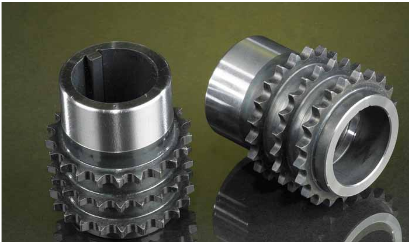
The automotive engine Award of Distinction went to these V6 engine crankshaft sprockets.