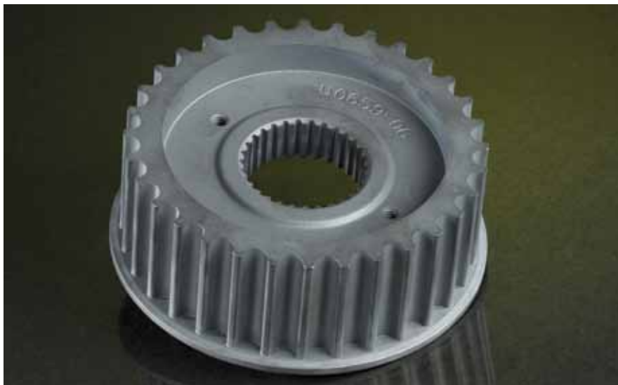
In the hand tools/recreation category, this motorcycle drive sprocket won an Award of Distinction.