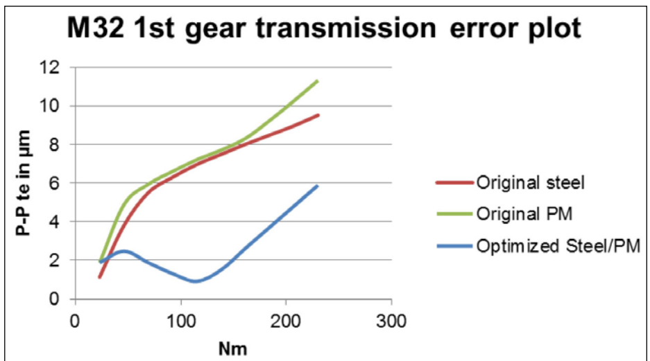
Figure 2 Transmission error for first gear in the investigated M32 transmission.

The durability of the sixth gear pair is illustrated in Figure 3, where the duty-cycle is taken into account. The red, blue and black lines are S-n curves for sintered, case-hardened, Astaloy85Mo PM gears, with a density of 7.25g/cc and tolerance class of ISO 7 or better. What is learned from the diagram is that, while the tooth root bending fatigue is within acceptable boundaries, the contact stress is still a bit too high, meaning that these gears would require a slightly higher performance level to qualify. The remedy in