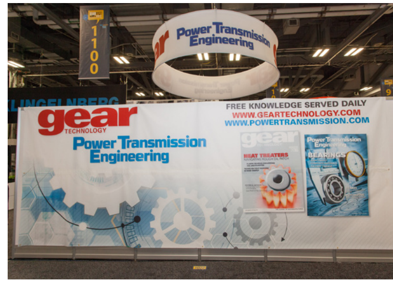
Come and meet the AGMA Media team in Booth #3132 and at the "Ask the Expert Stage" in Booth #3136.

On the show floor itself, you'll have plenty of opportunities to learn and interact with gear-industry colleagues, including live podcasts, exhibitor demonstrations and our own "Ask the Expert" panel discussions in booth #3136.