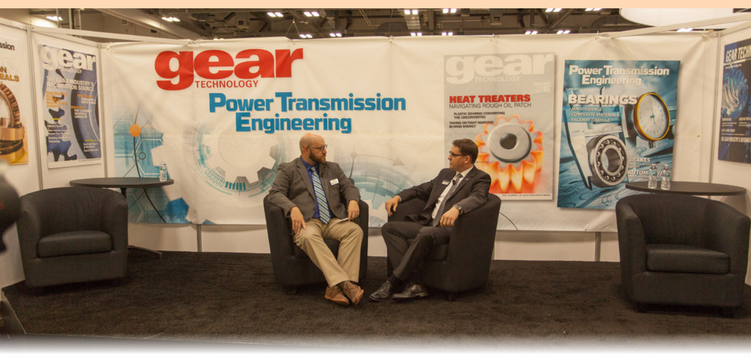
Gear Technology and Power Transmission Engineering editors will sit down with technology experts throughout MPT Expo for one-on-one interviews as part of our Revolutions video series.