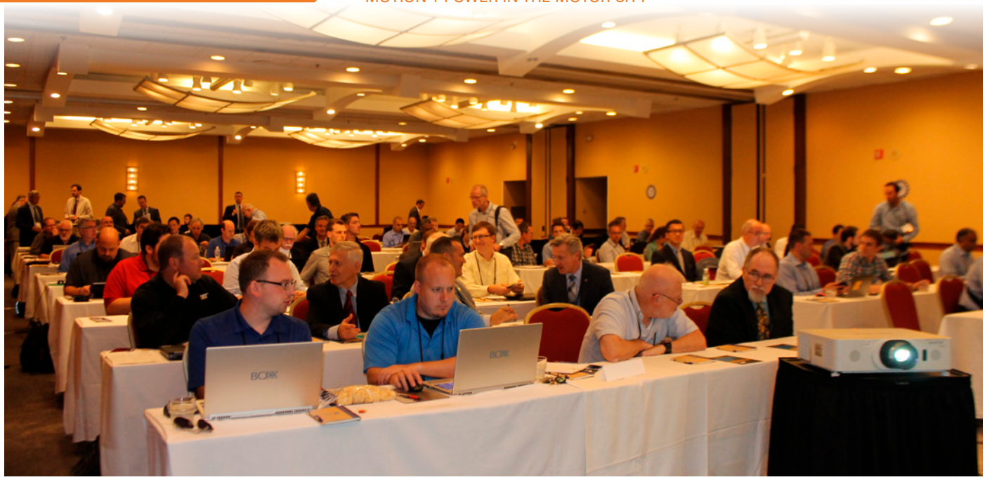
AGMA's Fall Technical Meeting attracts engineers and technical specialists who want to learn the latest technical information about gears from the world's leading experts.