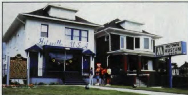
Hitsville U.S.A., the original home of Motown Record Corp., is part of the Motown Historical Museum.

The recording studio for "Stop in the Name of Love" was Studio A, now a part of the Motown Historical Museum.