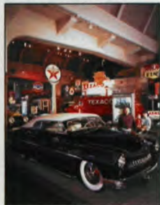
The Henry Ford Museum includes The Automobile in American Life exhibit.

For more information, contact the American Gear Manufacturers Association by telephone at (703) 684-0211, by fax at (703) 684-0242, by e-mail at gearexpo@agma.org , or on the Internet at www.agma.org . For information on expo exhibitors and more, visit www.gearexpo.com or visit Show Central at www.geartechnologyexpo.com .