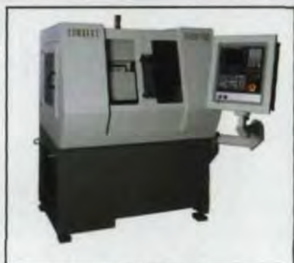
An expo exhibitor, Lambert & Wahli offer a variety of manufacturing equipment, including this gear hobbing machine.

Broach Masters/Universal Gear Co.—Booth 720 Broaching Machine Specialties Co.—Booth 700 Cadillac Machinery Co. Inc.—Booth 1033 Canmac Gears & Reducers Inc.—Booth 115 Capstan Atlantic—Booth 714 Chamfermatic Inc.—Booth 1125 The Cincinnati Steel Treating Co.—