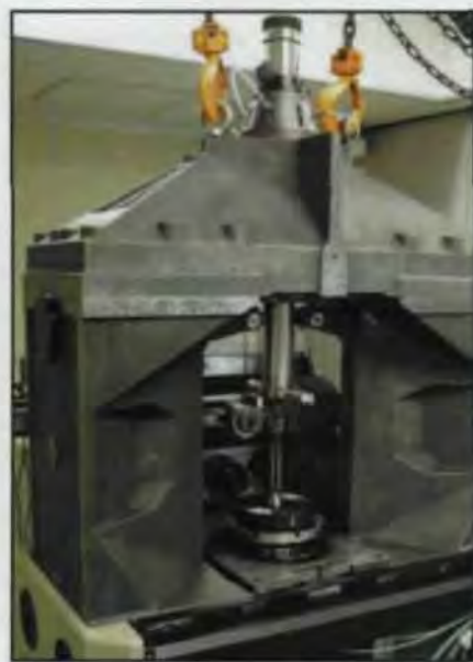
Russell, Holbrook & Henderson's ultra precise gear measuring machine certifies the accuracy of gears within 0.1-0.3 μm.

See us at AGMA with Liebherr in Booth #1400