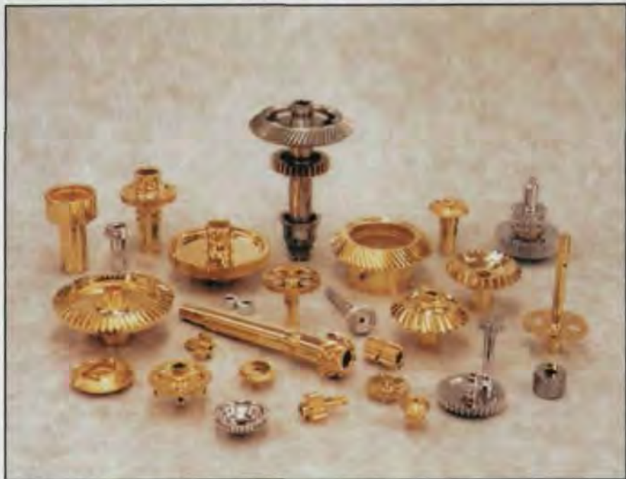
Arrow Gear Co. will showcase precision manufacturing accessories for bevel, spur and helical gears from Booth 933.

Paulo Products Co.—Booth 814 Perry Technology Co.—Booth 1009 Precision Gage Co.—Booth 723 Preco Laser Systems L.L.C.—Booth 909 Presrite Corp.—Booth 820 Process Equipment Co.—Booth 726 Pyromaitre Inc.—Booth 1308 Quality Heat Technologies—Booth 1320 Rack & Pinion Inc.—Booth 622 Raycar Gear & Machine Co.—Booth 1309 Redin Corp.—Booth 510 Reishauer Corp.—Booth 1200 Reliance Gear Corp.—Booth 826 REM Chemicals—Booth 1111 Ribaut/Manoir—Booth 1014 Ronson Gears Pty. Ltd.—Booth 1214 Russell, Holbrook & Henderson—Booth 313 Samputensili—Booth 1134 Schafer Gear Works—Booth 708 Schütte TGM Ltd.—Booth 113 Scot Forge Co.—Booth 1213 Seco/Warwick Corp.—Booth 1128 Seitz Corp.—Booth 821 S.L. Munson—Booth 218 Solo World Partners—Booth 1208 Specialty Steel Treating—Booth 1133 Speedgrip Chuck Inc.—Booth 1105 Star Cutter Co.—Booth 1134 Star-SU Inc.—Booth 1134