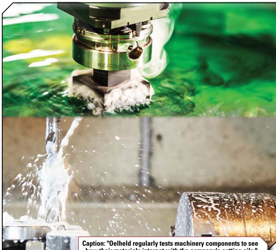
Caption: "Oelheld regularly tests machinery components to see how their materials interact with the company's cutting oils."

While it might sound like such a minor thing, Oelheld's efforts on this front can actually have a big impact by preventing unexpected costs during production. Once the silicon gets into your lubricant, your only course of action is to just replace it. Entire barrels of lubricants can get ruined in this fashion, which not only affects your bottom line as you have