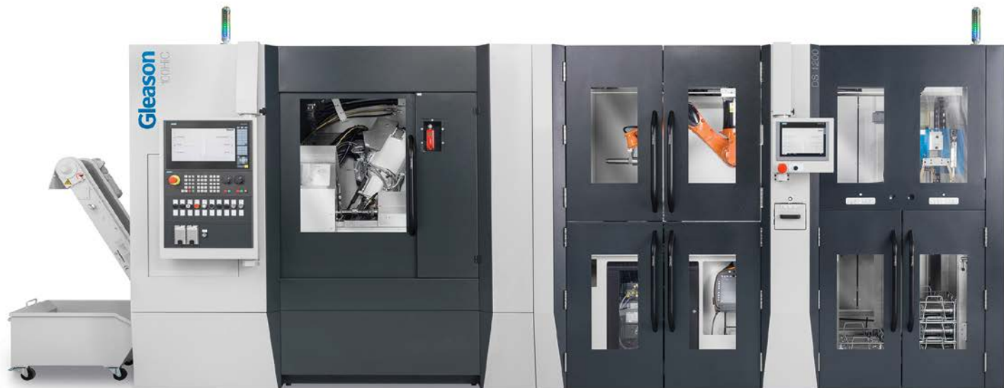
Gleason's 100HiC horizontal hobbing machine with integrated chamfering and robot loading cell.

advance of a subsequent hard finishing operation. Chamfer rolling today can be integrated into shaving, power skiving and hobbing machines and performed either in parallel or sequential to the main gear process. Where shortest cycle times are required, chamfer rolling is integrated parallel to the hobbing process on machines such as the horizontal Gleason P90CD Hobbing and Chamfering Machine or the ZSE150 Shaving Machine. When a second hob cut is necessary to remove the flank burr, a horizontal 100HiC or vertical Genesis 210HiC is available. The latest tool design developments increase chamfer rolling tool life significantly, especially with dry operation.