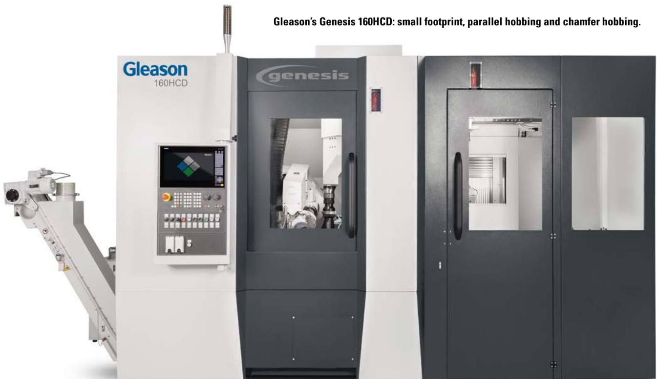
Gleason's Genesis 160HCD: small footprint, parallel hobbing and chamfer hobbing.

The Chamfer Contour Milling process is continuously indexing and creates a cutter path that envelopes the tooth geometry from the outside of the part in. All six axes in the chamfer unit are used during generation of the tool path, and the tool seeks to use the straight side of the indexable blades to optimize the process and tool life. Since each edge of the tooth is done separately and the chamfer