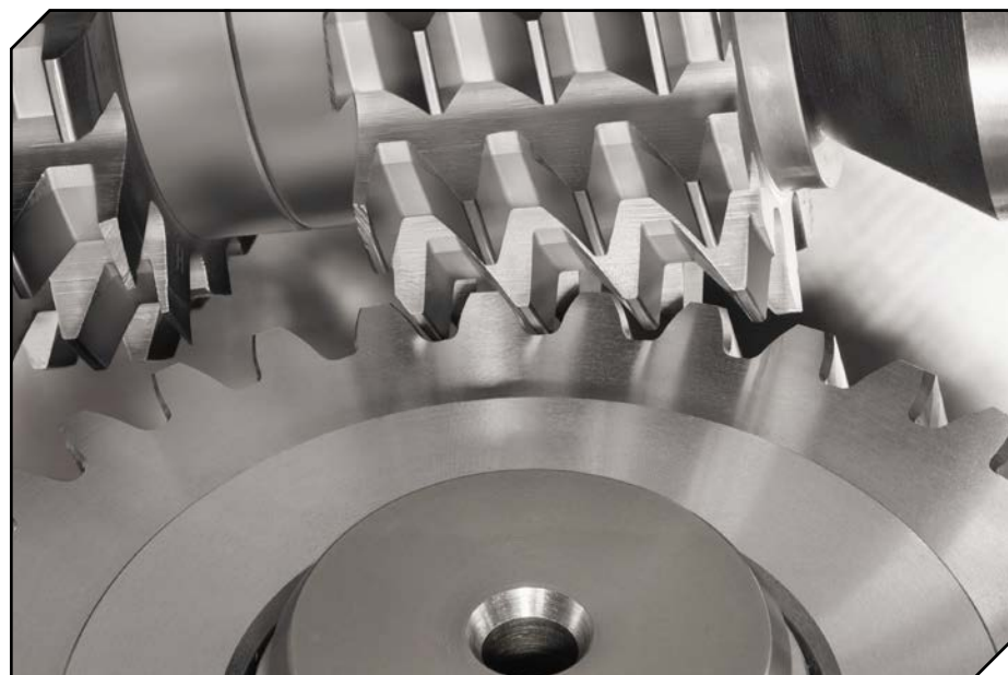
Cutting the chamfer with a chamfer hob.

Finally, the Gleason Chamfer Hobbing process offers tool shifting, which delivers increased tool life, minimal change over times and, ultimately, lower cost-per-piece. Additionally, the existing grinding capabilities for gear hobs can be used as well for Chamfer Hobs.