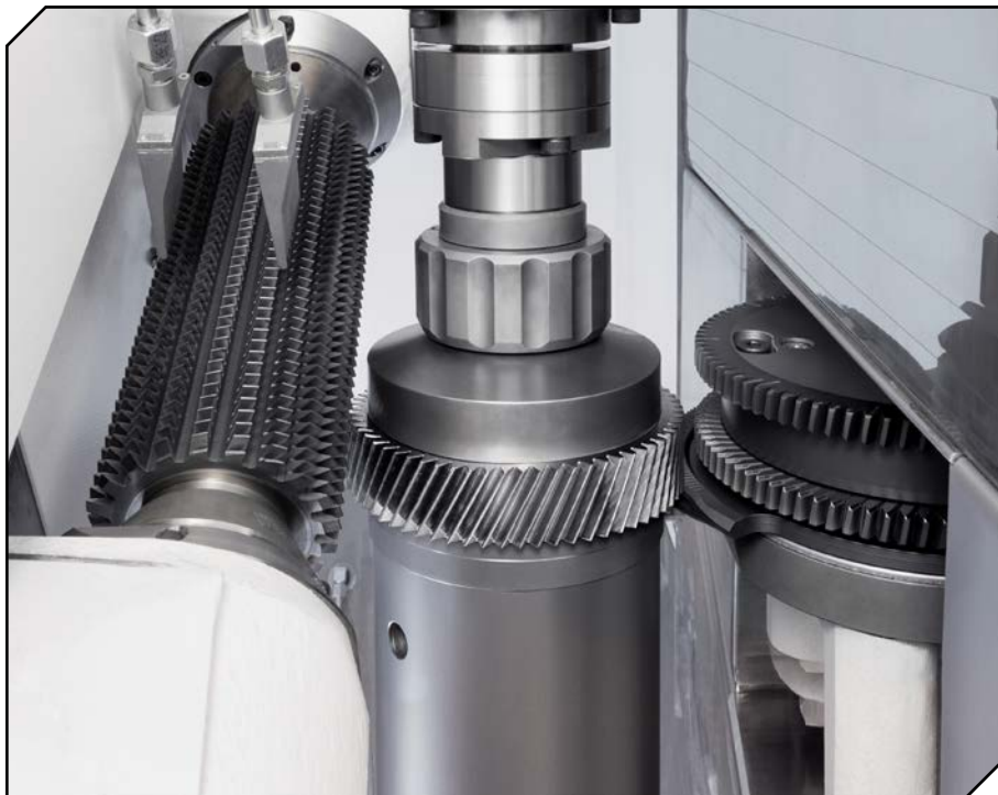
Chamfer rolling on vertical 210HiC for burr free flank with a sequential hob-chamfer-hob process.

Chamfer rolling is ideal for planetary pinion applications requiring particularly fast cycle times (10 seconds or less chip-to-chip) or for gears on shafts with little or no clearance below the root diameter. In wet machining operations, this process delivers the lowest possible tool cost per workpiece. Chamfer rolling is a forming process applied mostly for smaller gears up to module 5 mm, which creates chamfers along the tooth edge by pressing material. The pressed material forms a burr on the face side of the gear and a smaller one on the tooth flank. While the gear face burr is removed by single blades, deburring discs or file discs, the flank burr requires special chamfer rolling tools with burr-removal functionality or removal by an additional hob cut downstream in