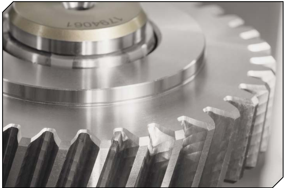
Chamfer size and angle according to customers' specification.

Chamfering and deburring are particularly critical in advance of hard gear finishing processes. This is especially true of honing, where excessive stock and hardened burrs can greatly diminish honing tool life and, as a result, significantly increase cost per piece. These conditions can occur as well when the finishing process is threaded wheel grinding.