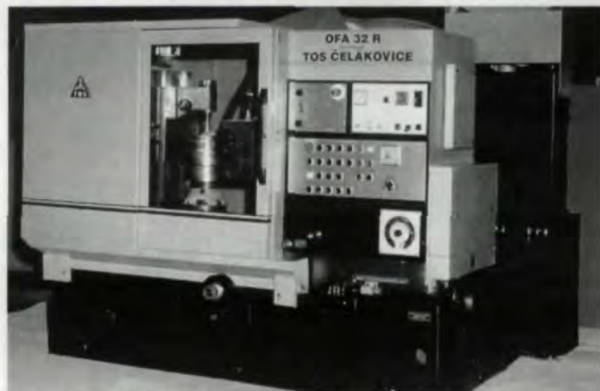
Gear Hobbing Machine, Model OFA 32 R

TOS ČELÁKOVICE offers Gear Hobbing and Shaping machines in manual and CNC versions. The machines accept workpiece diameters ranging from 6"-27" and are suitable for single piece and batch production.