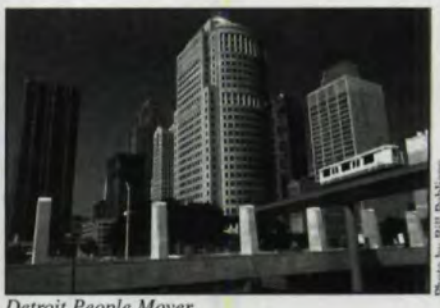
Detroit People Mover.