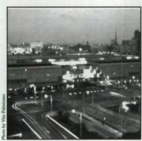
Cobo Hall at night.

The "new," refurbished Cobo Conference/ Exhibition Center is one of the largest convention facilities in the U.S. It now spans more than 17 acres of downtown Detroit and has more than 700,000 sq. ft. of exhibition space. There are 85 separate meeting rooms, which are linked to the exhibition halls by 26 escalators. The hall is named for the late Albert E. Cobo, Detroit mayor from 1950-1957. It is also the site of the Michigan Sports hall of fame and of one of Detroit's most recognizable figures, a statue of Joe Louis, which graces the facility's main entrance.