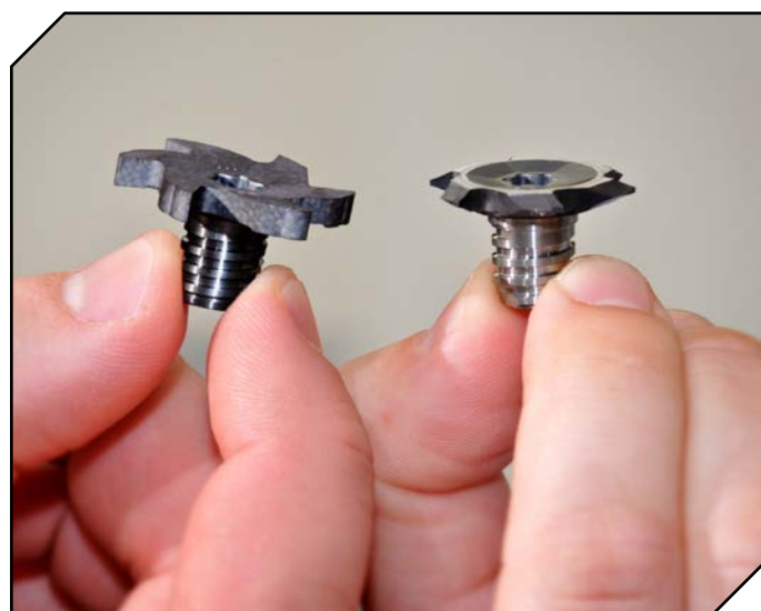
ASPI's gear tooth tooling typifies the many Ingersoll Chip-Surfer modified standard slotting tools in service today. Ingersoll stocks the standard blanks (left) and simply grinds them to required form.

Thornburg suggested treating the teeth as short slots and machining them with a one inch form-matched Chip-Surfer T slotting mill oriented like a slitting tool. The cutter features a small replaceable tungsten carbide tip mounted on a threaded carbide shank. By itself, moving from HSS to carbide would enable much higher machining rates and extend edge life, Thornburg reasoned. The replaceable tip design, moreover, would minimize the amount of carbide used and enable in-spindle tip replacement. The carbide shank, which was reusable, would stiffen the cutting system for a better finish on the wear surfaces of the teeth.