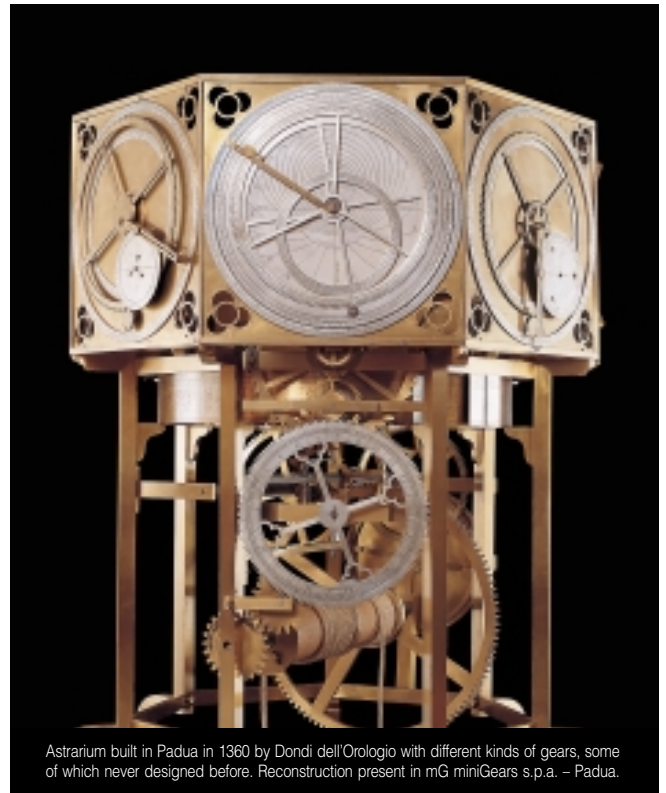
Astrarium built in Padua in 1360 by Dondi dell'Orologio with different kinds of gears, some of which never designed before. Reconstruction present in mG miniGears s.p.a. - Padua.

Vitrified grinding wheels are much more durable today, Barden says, because of new materials used in blended-grain compositions and because of improvements in the bonding process. They have greater toughness and form holding capability, and they have higher stock removal rates, he says. Barden says those higher rates have resulted from improved grain struc-