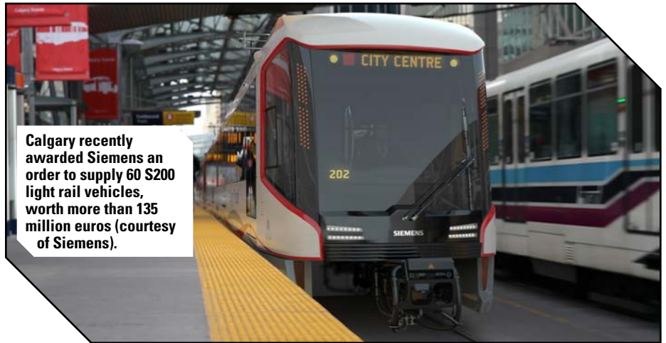
Calgary recently awarded Siemens an order to supply 60 S200 light rail vehicles, worth more than 135 million euros.

ridership growth throughout the United States will continue."