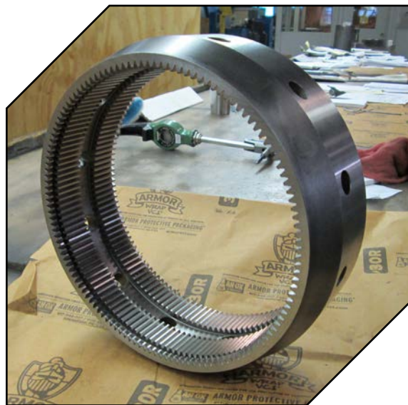
Overton Chicago Gear provides gearing for diesel engines, traction drives and light rail vehicles.

Today, the Pioneer Zephyr sits in the lobby of the Museum of Science and Industry in Chicago, a relic from an industry that was mostly replaced by highways and airports back in the 1950s. For many years since, the U.S. rail industry (outside of freight) has been a transportation afterthought. But thanks to high-speed rail programs in Europe and Asia, the debate continues on the manufacturing and transportation benefits of