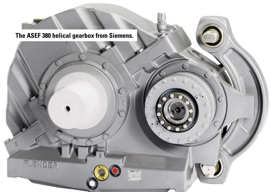
The ASEF 380 helical gearbox from Siemens.

Calgary is the third largest city in Canada and its population has grown