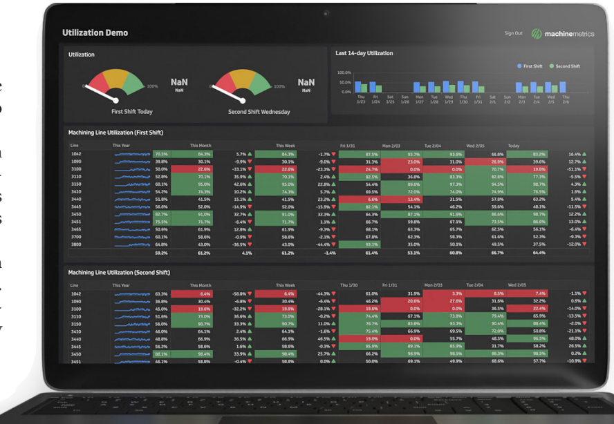
MachineMetrics Utilization Reporting.

"First, they're not using analytics or data to drive decisions. Second, manual data entry can create all sorts of misunderstandings to what is actually taking