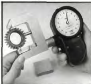
External spline gage with built-in gage pins saves time and eliminates operator variability.

Checking internal spline diameters has never been easier.