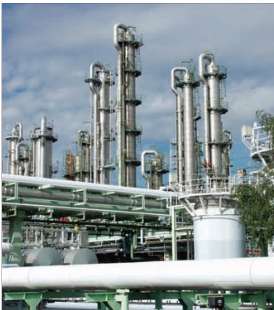
To remain competitive globally, Ticona has factories around the world like this facility in Kelsterbach, Germany.