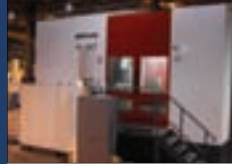
Hofler 1000 HF CNC Gear Hobbing Machine • First in the world with on-board Gear Inspection