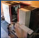
Hofler Rapid 1500 CNC Gear Grinder • DIN1 / AGMA15 Quality Level