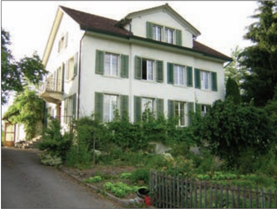
KISSsoff communicates daily with its global customer base from its main office in Hombrechtikon, Switzerland.

very rarely expressed directly, and the word “no” is avoided if at all possible. Negotiations will not begin until a well-established relationship is in place. Meetings begin with small talk and normally involve personal questions as a way of building rapport between the individuals involved.