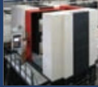
Hofler Rapid 2000 CNC Gear Grinder • Operational Summer 2008 • Any imaginable profile and lead modification possible

In order to guarantee control of our manufacturing process & maintain the high level of quality that our customer's demand, VanGear's Quality Control has passed through a large number of accreditation programs.