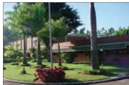
Star-SU's facility in Jundiai, Brazil.