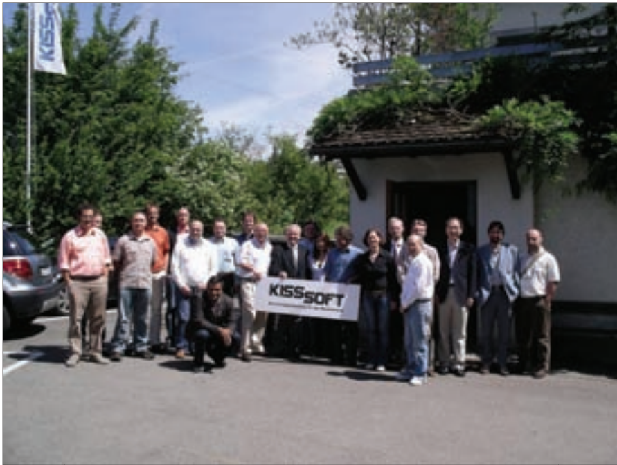
The international sales team at KISSsoft stands in front of the main office in Hombrechtikon, Switzerland.

project, the company provides the same brand experience whether it is in Frankfurt, Detroit or Shanghai. By insisting each facility adheres to the same performance characteristics and specifications, the company eliminates possible cultural or language hurdles.