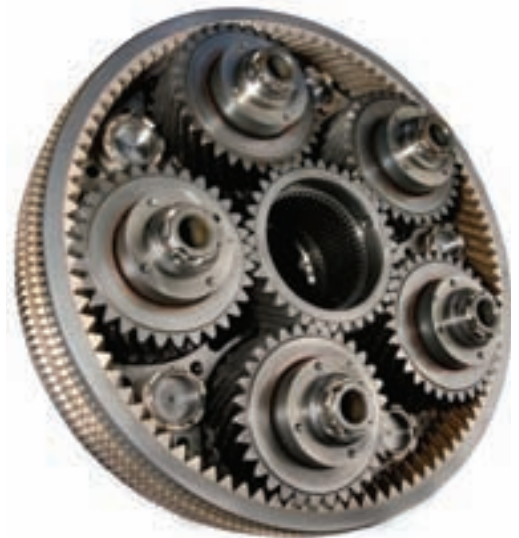
A close-up of the five stationary gears in the geared turbofan engine speed reducer gearbox.