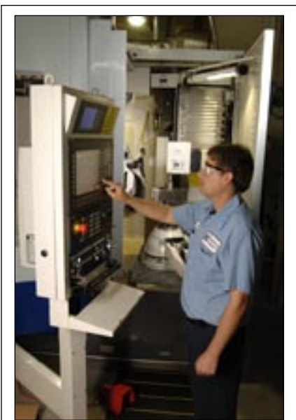
Siemens controls allow a customized user interface.