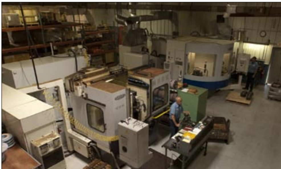
Custom Gear and Machine's new Reishauer RZ-400 helps them cut cycles times to a fraction of what they were using an older machine.

Rose explains, "We were looking to expand our gear grinding capability and the Reishauer RZ400 offered us many benefits, including 400 mm O.D., 10 mm root diameter, up to 999 teeth capability, helix angles to \pm 45 degrees and a z-axis of 300 mm, all features we could use on a daily basis. We also liked the easy access four-door configuration and serial interface, plus the machine's auto wheel dress-